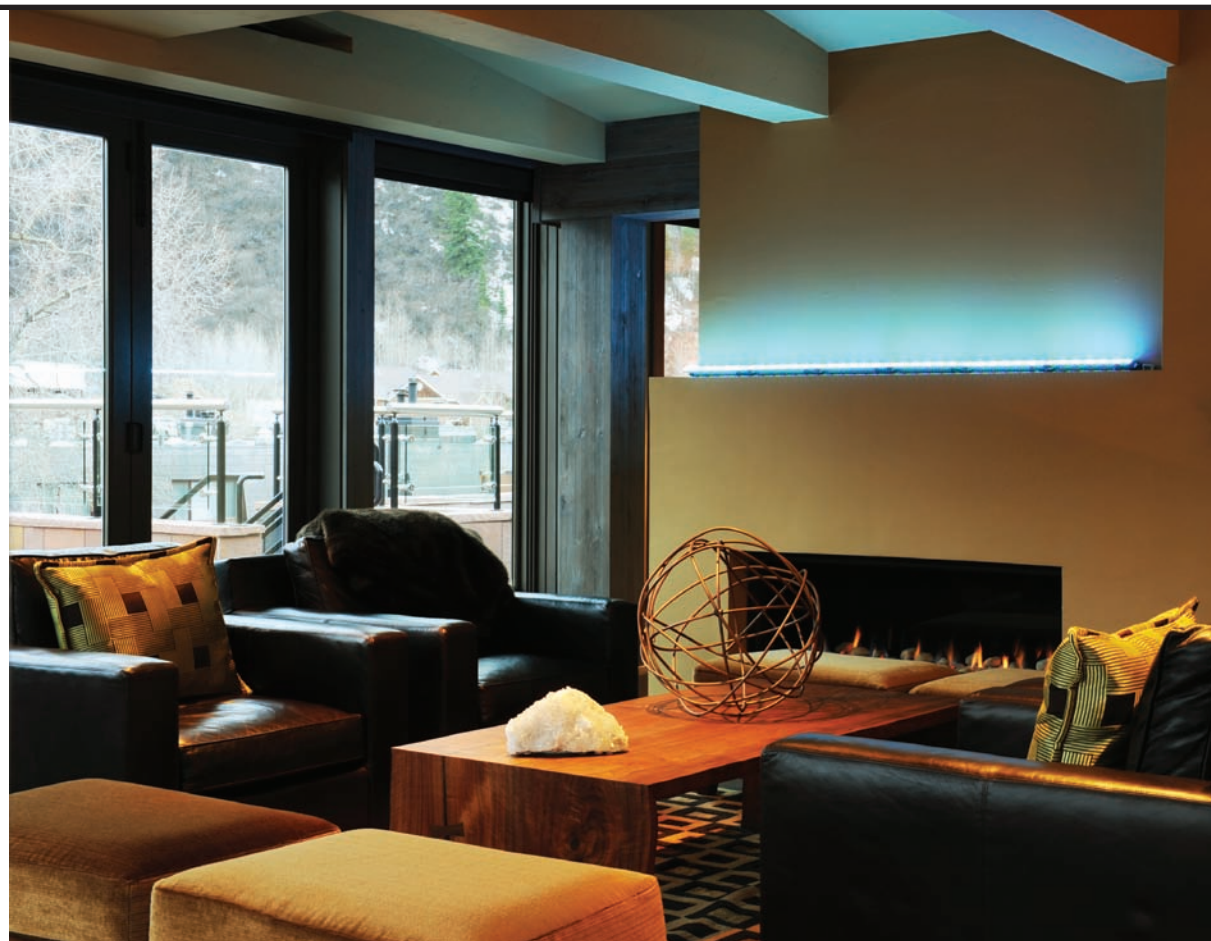
A SHARED ROOFTOP TERRACE HAS INTERIOR LOUNGES, AND EXTERIOR JAPANESE SOAKING TUBS, AS WELL AS A 360-DEGREE VIEW OF ASPEN