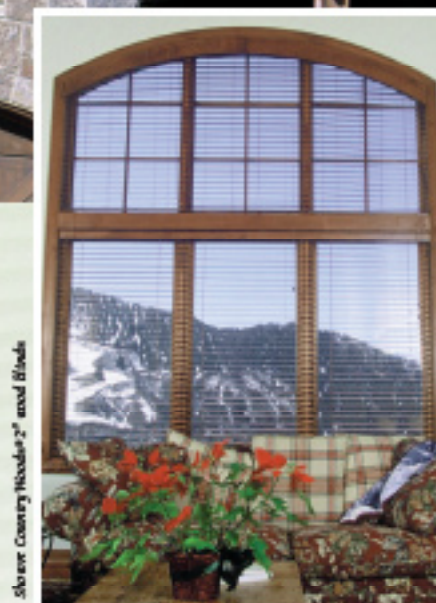
Shore Country Woods® 2" wood Blinds

“Greg is good at what he does, very professional, and an entertaining guy to do business with. Bottom line?: He provides great value.”